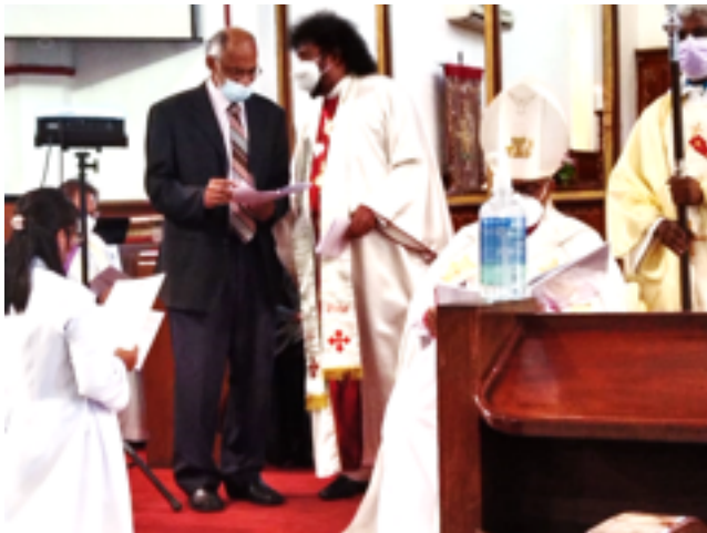
Issuing the respective Licences to the Candidates