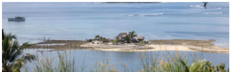
What is left of Walanda island

It appears that Kiribati, the Marshall Islands and Tuvalu (all in the Pacific) are anticipated to be under water by the end of the century. Presently, hundreds of villages are listed for relocation in Fiji.