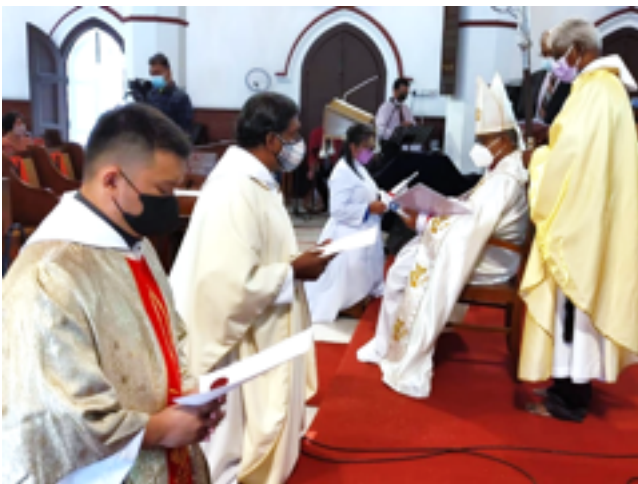
Receiving the 'Charge' as servants of God from the Diocesan Bishop