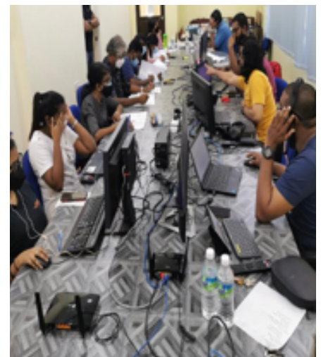
Members of the Zoom Tech Team