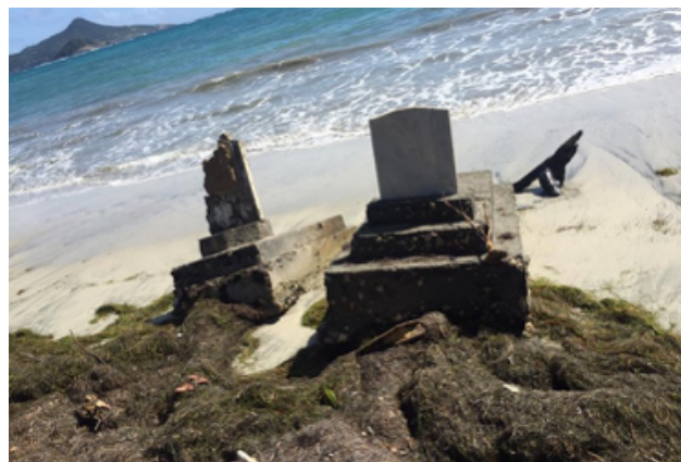
In Grenada, graves are being lost to the sea with rising sea-levels.