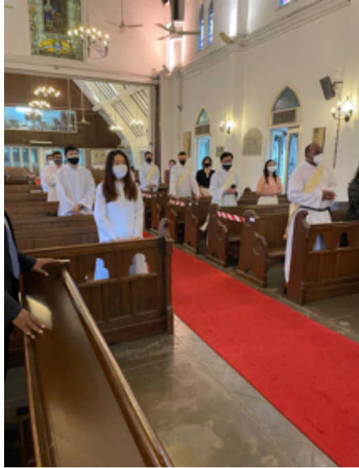
Ordinands on either side of the isle

Before coming to this Ordination service we had tasted the goodness of God through the years. Jesus said, "My grace is sufficient for you, for my power is made perfect in