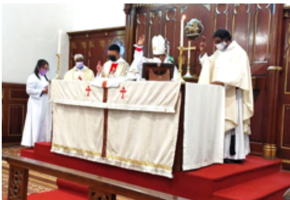
The Final Blessing by the Diocesan Bishop and the newly-ordained Priests