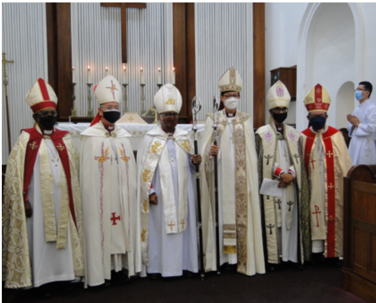
Bishops in attendance