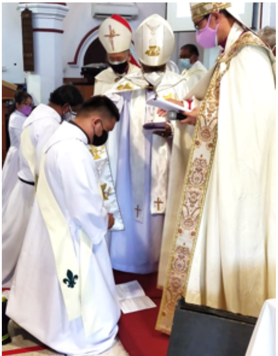
Commissioning and Ordination with the three Bishops in action