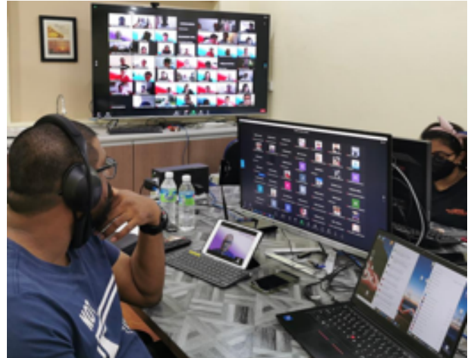
Delegates during the Synod 21 Zoom session

The Diocesan Synod 2021 was held on the 9 November 2021 and was hosted by the Church of the Holy Spirit, Ipoh. A total of 231 delegates participated. Though it was originally scheduled to be held from 24 to 26 August 2021, the Covid 19 pandemic with the Movement Control Order restrictions and the fear of infections meant that the Synod date had to be shifted to 9 to 11 November 2021. However, based on feedback and after weighing in the risk factors, it was finally decided to conduct a half day Zoom session fixed for 9 November 2021. Synod conducted under a ZOOM platform was shortened to about five hours instead of the usual two-day meeting. With the limited time it was more of a “need to” sort of session with financial matters and others being approved in compliance with the Synod rules.