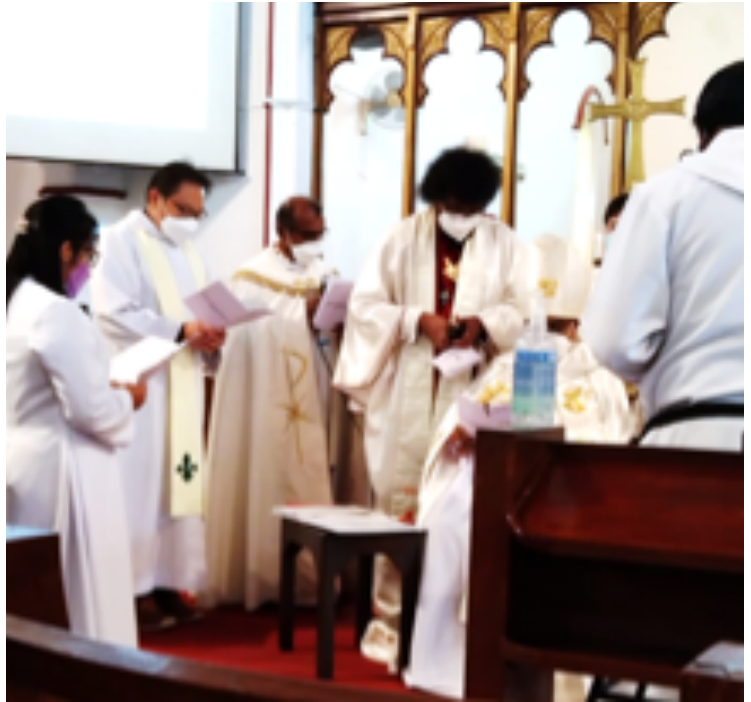
Presentation of Candidates by the Examining Chaplains

The preparation for the Candidates for Ordination and Commissioning comprised the MICPE Program, writing two mini-theses and an Ordination Retreat, all of which were completed by July this year. The Retreat was a time when we were encouraged to be firm in our calling to serve the Lord and to prepare for the implications of our ministries as Deacons, Priests and Deaconesses. This preparation was followed by the reading of the 'Si Quis' in our respective Churches as a public announcement of our intention for Ordination or Commissioning and a test of approval from our respective Church Congregations. The 'Si Quis' was read on three Sundays prior to our Ordination or Commissioning.