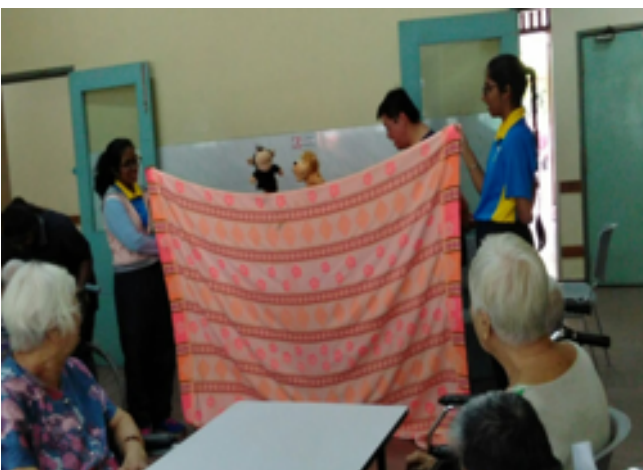
Girls' Brigade Visit to the Old Folks' Home