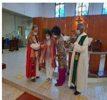
25th Anniversary Celebration

motivational activities were held for them. We encouraged them to pick up painting, repairing, and construction, grass cutting, gardening skill so they can earn a living