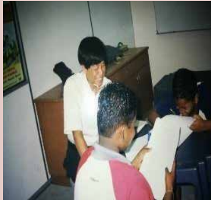
Free Tuition classes