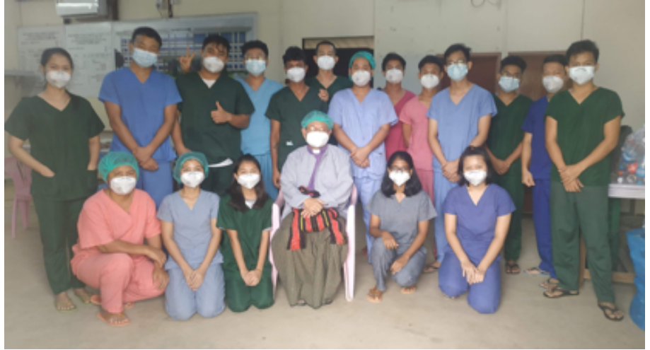
Archbishop Stephen Than Myint Oo with the volunteers

The corona virus was confirmed to have reached Myanmar on 23 March 2020. The Yangon Region government had prepared 500 apartment units and two 300 bed hospitals for quarantine purposes. Myanmar Council of Churches was recruiting youth volunteers to serve at the quarantine Centers since 22nd April 2020. There are over four hundred youth volunteers both Christians and non-Christians now serving as members of MCC Covid-19 Fighting Volunteers team in four Covid-19 Centers. The Anglican Archbishop, the Most Rev Stephen Than