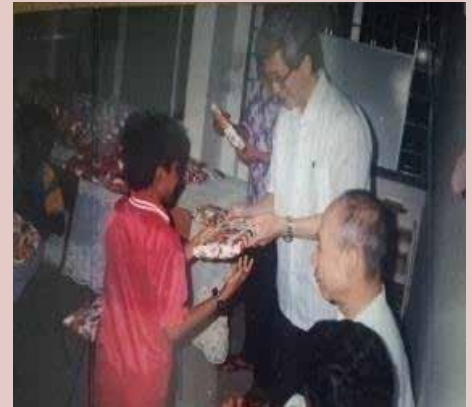
Year End Tuition Celebration