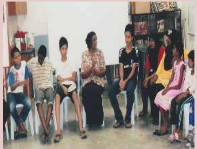
Bestari Social Club activities

A unit on the first floor of a shop house was rented and converted into a tuition centre, providing free English lessons to the underprivileged children living in the area. Subsequently Mathematics and Science were also taught by volunteers from St. Paul's Church. Sunday school classes and bi-monthly activity based Bestari Social Club also commenced thereafter.