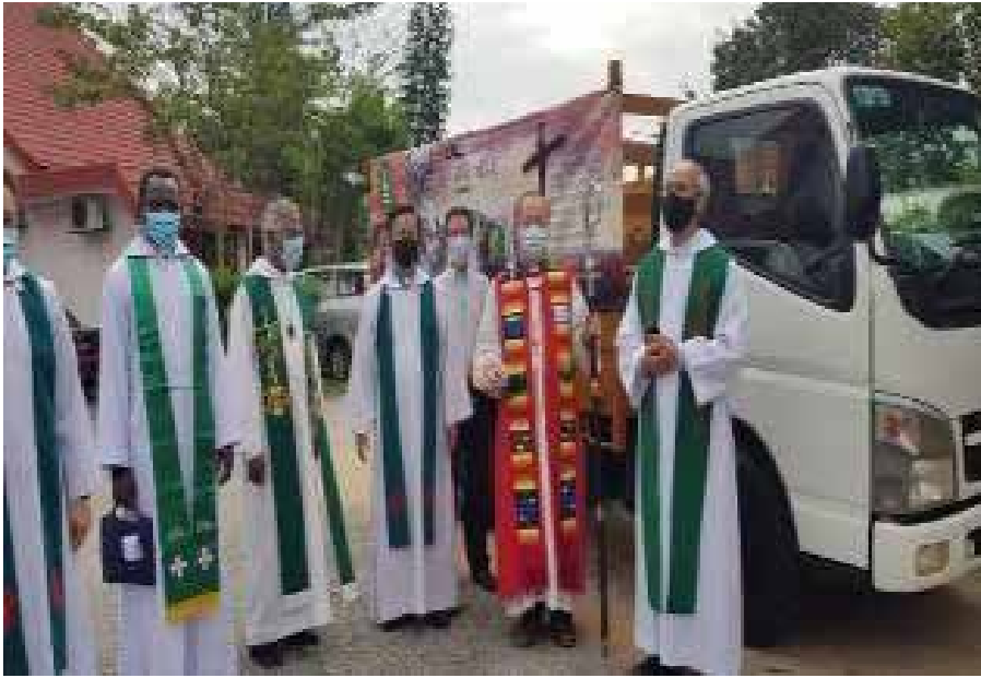
Blessing of lorry for Seed of Hope