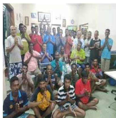
Residents of Seed of Hope Home