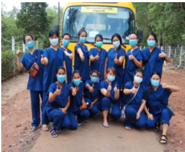
Youth volunteers from the Church of the Province of Myanmar