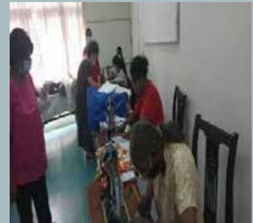
Palm Sunday Procession