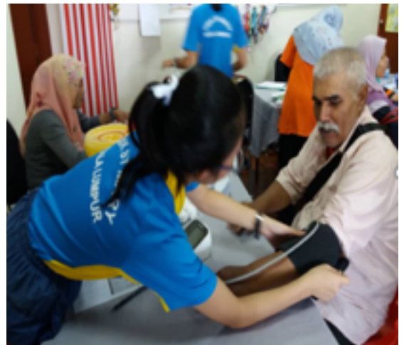
Our girls doing health checks in a community clinic

Taking the cue from Good Neighbours, other clubs and societies in the school have started to include projects to instil compassion