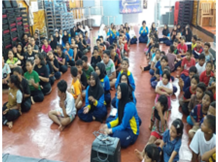
Visit to Kg. Semoa in Raub, Pahang

In keeping with the school motto, 'I Serve', St. Mary's Secondary school set up a club in the early 1960's named 'Good Neighbours' to help those in need. They rendered help initially to the poor students who were coming to school without having a proper meal. They provided breakfast and hot drinks before moving to the community.