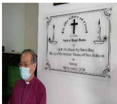
Dedication of Seed of Hope Home