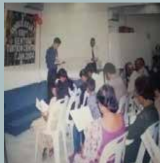
10th Anniversary Celebration