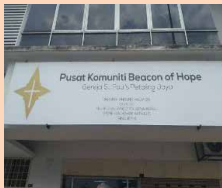
Current premises since 2012

Current activities being carried out here include Sunday Tamil-English Church Service, Mandarin Service, Bahasa Malaysia Fellowship, Sunday school, Tamil/English/Chinese Bible Study, Alpha Course, Discipleship Training, free Tuition Classes, Motivational talk, Annual prize giving celebration, Carrier talk, Health Talk, single mothers program, sewing classes, beautician classes and baking classes. Many of these activities were initiated during the Diocesan Decade of Mission and Networking Mission Challenge: One in Christ (2011-2020).