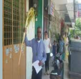
MCO PPE Sewing classes