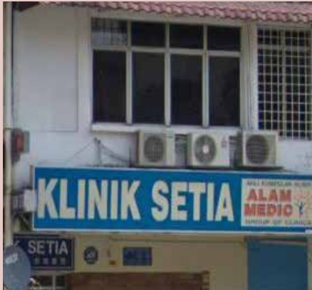
First shop house used for Ministry