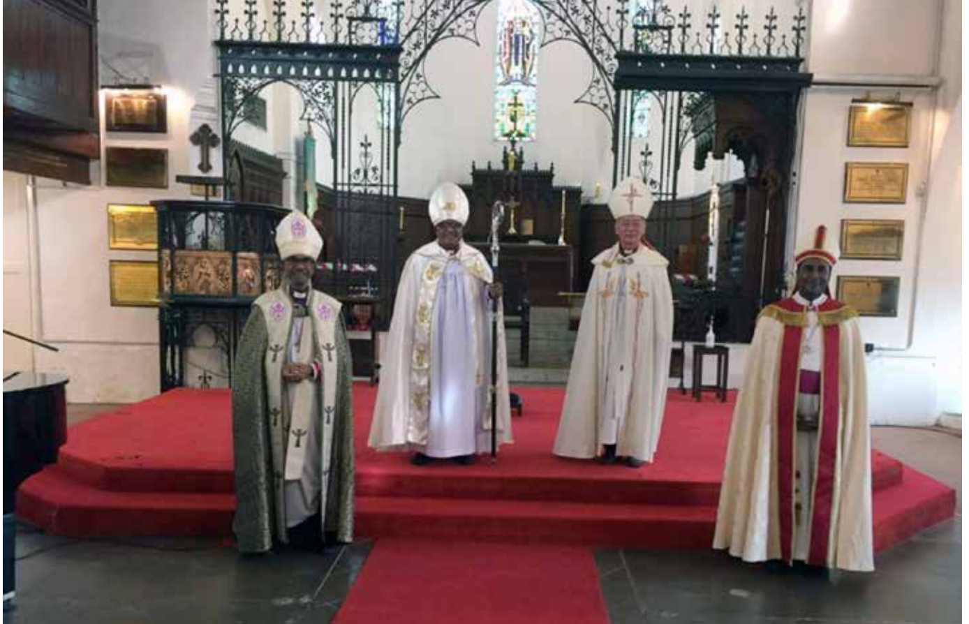
Bishops in attendance