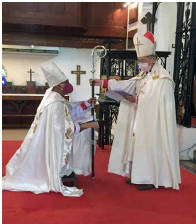
The Crosier was handed to the Bishop designate