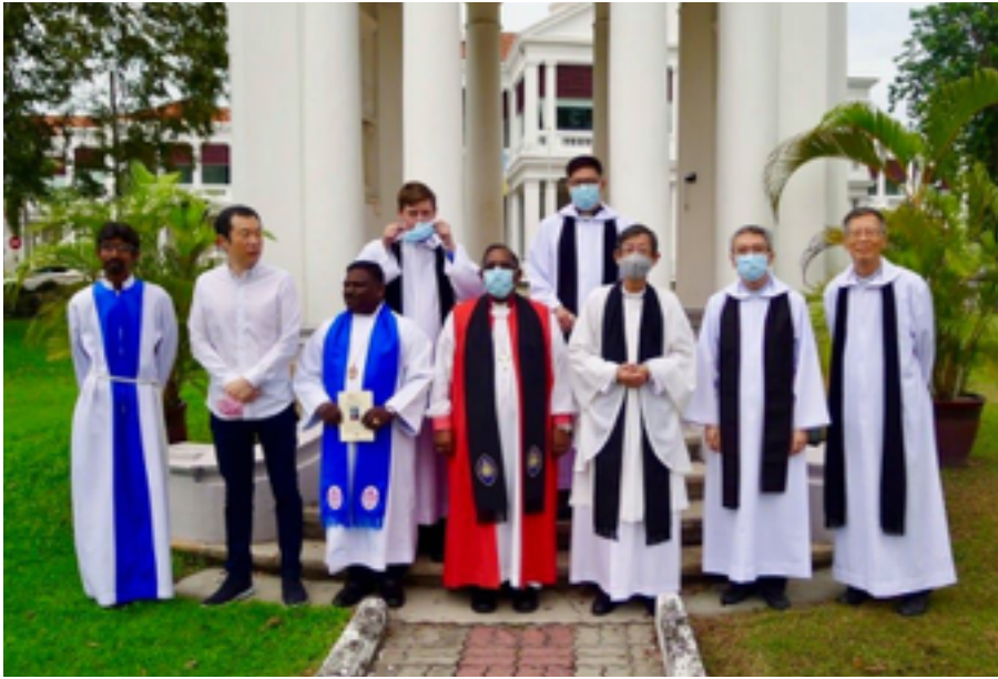
Farewell Group photo