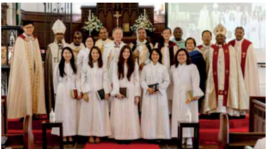
The commissioned deaconesses