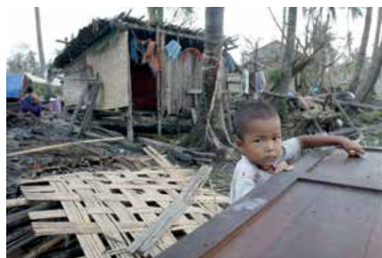
Devastation caused by Cylone Nagis