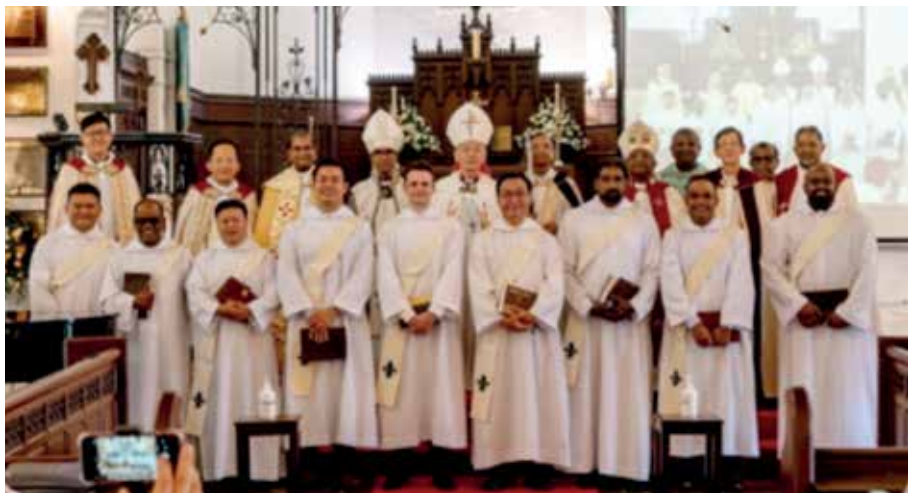
The ordained deacons