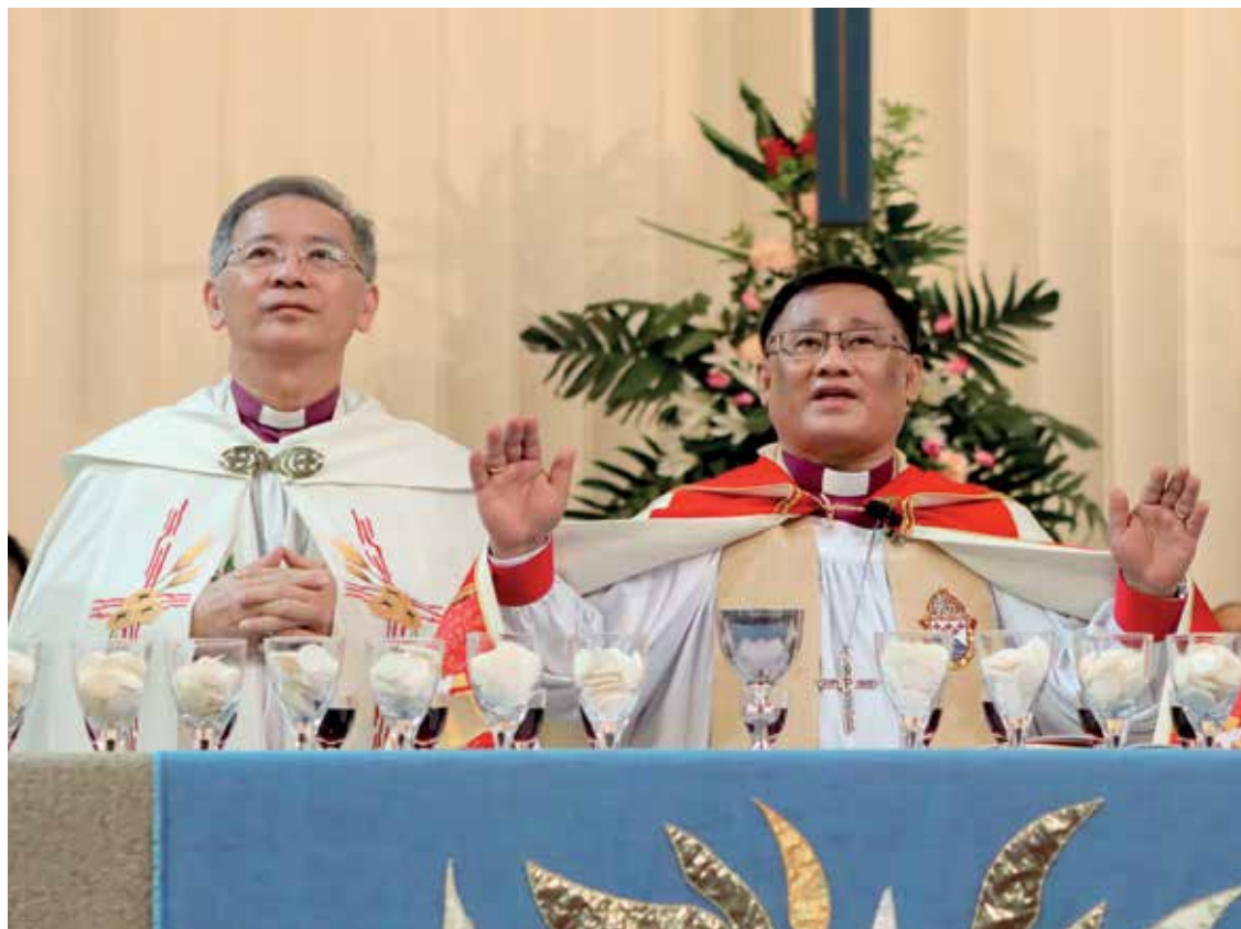
Consecration of the Holy Eucharist at the Installation Service of Archbishop Melter Jiki Tais

“And [Christ] gave the apostles, the prophets, the evangelists, the shepherds and teachers, to equip the saints for the work of ministry, for building up the body of Christ.” (Eph. 4:11-12)