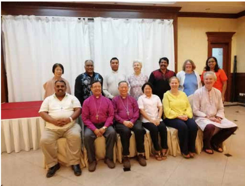
The Bishops with members of USPAG and the Oxford Mission UK

and then Archbishop of the Province of South East Asia .