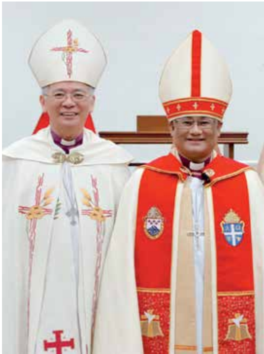
One in Christ

was leading a youth mission team to the Sabah Anglican Interior Mission (SAIM) in 1990. AVM has brought the Gospel to many Orang Asli villages, Chinese new villages and urban Indian communities. We in the Diocese of Sabah are honoured to have played a small part in the story of