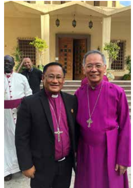
Brothers in Christ