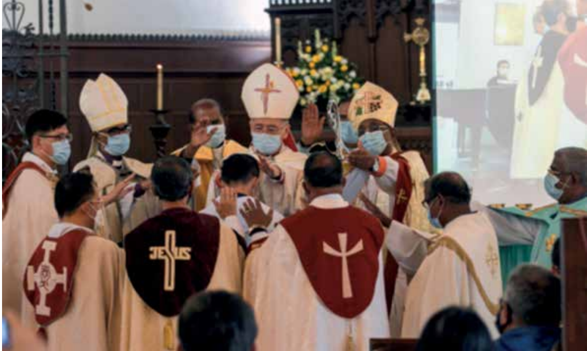
The laying on of hands on the ordained clergyman

Tuesday, 29 September 2020 marked a significant day in the liturgical life of the Anglican Church of West Malaysia. A total of 97 physical attendees gathered at St Mary's Cathedral Kuala Lumpur along with an additional 250+ online attendees to witness the ordination and commissioning of 20 young men and women for service in the Anglican Diocese with thirteen coming from the Diocese of West Malaysia and another seven coming from Holy Spirit Bukit Bintang. Adding to the monumental sense of occasion, the service also marked the 14 th and final Ordination and Commissioning service conducted by Bishop Ng Moon Hing who is due to retire in November.