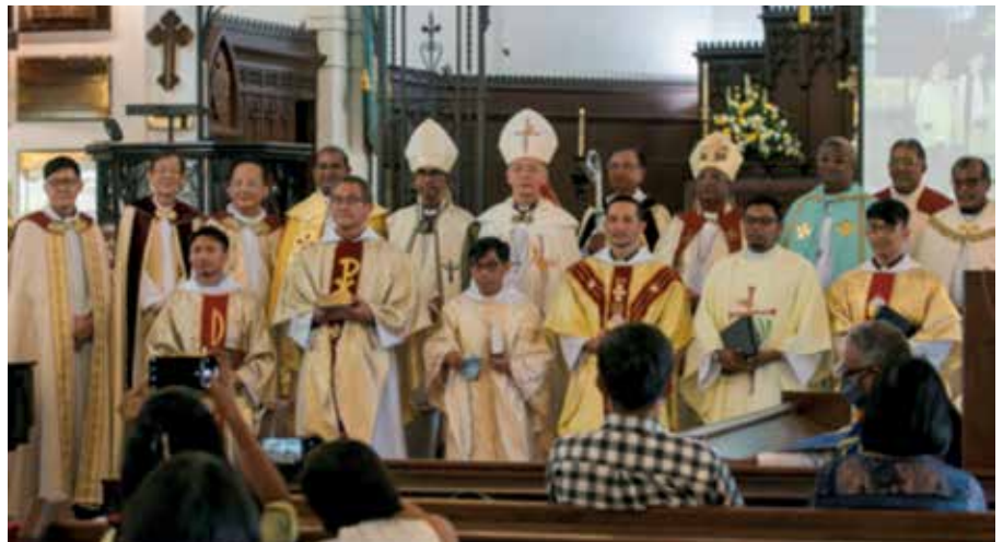
The ordained priests